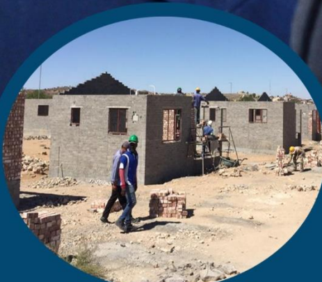
Projects Update 335 Houses