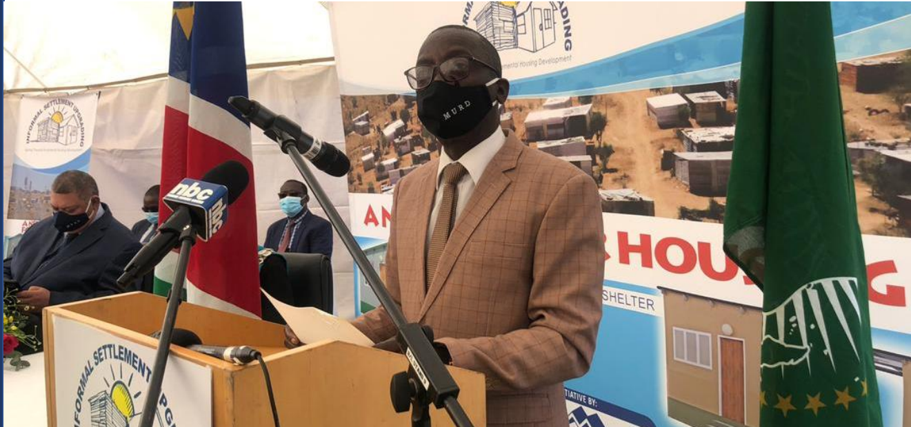
Hon. Erastus Uutoni Minister of Urban and rural development at the official launch of the Informal Settlement Upgrading Project delivering a keynote address.

The Informal Settlement Upgrading Pilot Project for the Construction of Affordable Housing was commissioned by the Honorable Minister of Urban and Rural Development (MURD) on 01 June 2020 at a Joint Consultative Forum between MURD, Mayor of City of Windhoek, NHE and Office of the Governor Khomas Regional Council.