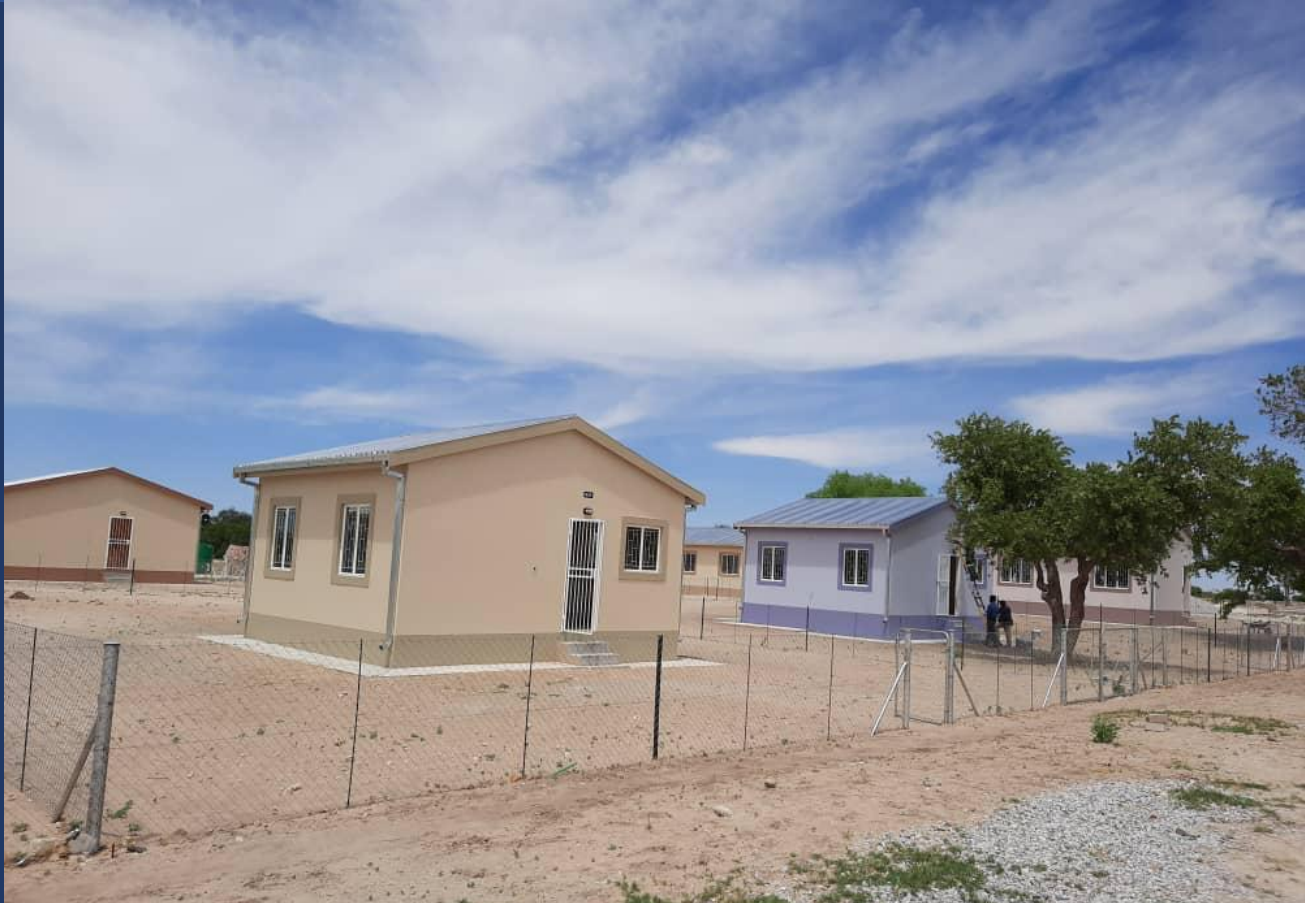
RFP Project Houses currently under construction in Omuthiya.

This RFP Phase 2 flagship project is estimated to the value of N$124 million. Under this arrangement NHE avails land for construction and the final products are sold to customers on the NHE's waiting list.