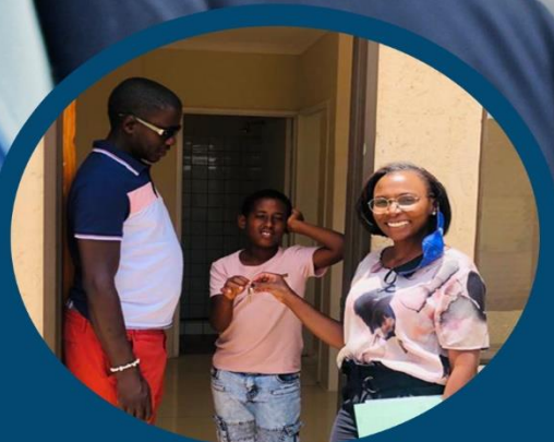
House Handovers Informal Settlement Upgrading Project Beneficiaries Speak