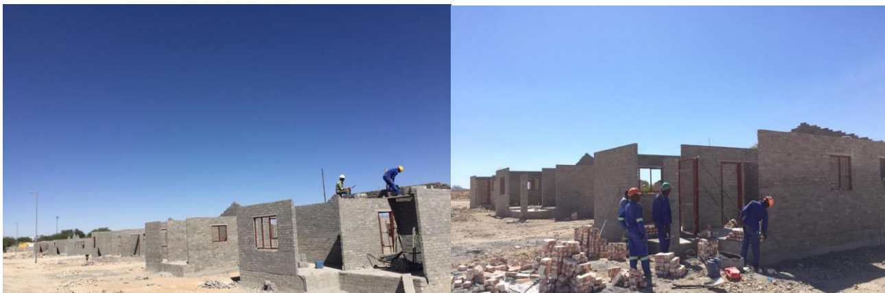
RFP Project Houses currently under construction in Okakarara.

This RFP Phase 2 flagship project is estimated to the value of N$124 million. Under this arrangement NHE avails land for construction and the final products are sold to customers on the NHE's waiting list.