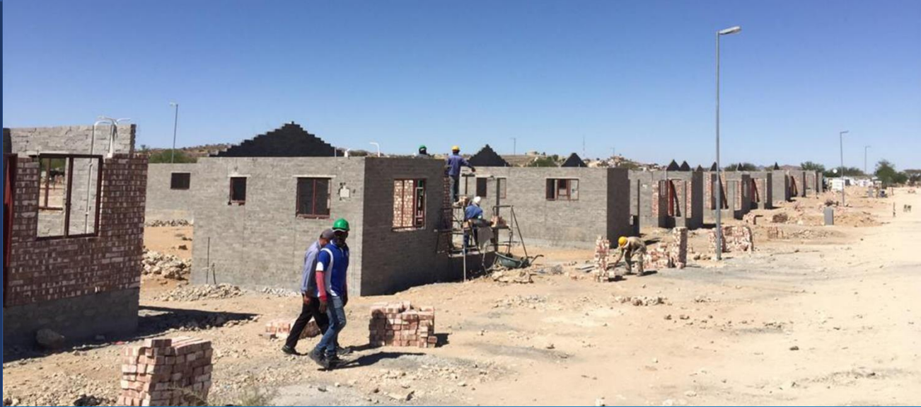
RFP Project Houses currently under construction in Karibib.

The National Housing Enterprise (NHE) has launched an exciting new housing development projects across the country that will see NHE construct 335 houses. This is part of its on-going efforts to empower Namibians through the provision of affordable and quality housing whilst continuing to fulfill its mandate.