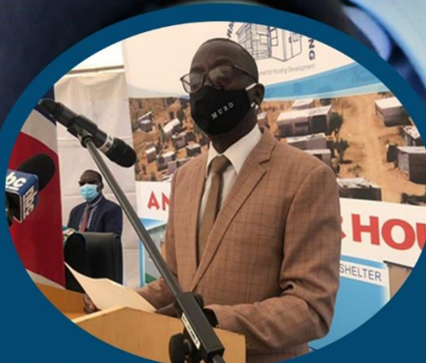
Informal Settlement Upgrading Project