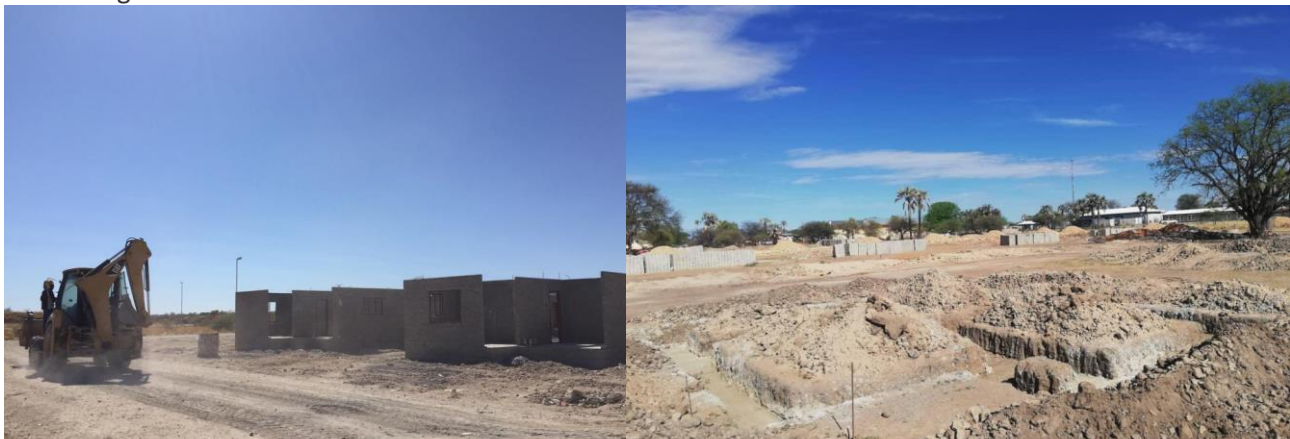
RFP Project Houses currently under construction in Outapi.

The National Housing Enterprise (NHE) has launched an exciting new housing development projects across the country that will see NHE construct 335 houses. This is part of its on-going efforts to empower Namibians through the provision of affordable and quality housing whilst continuing to fulfill its mandate.