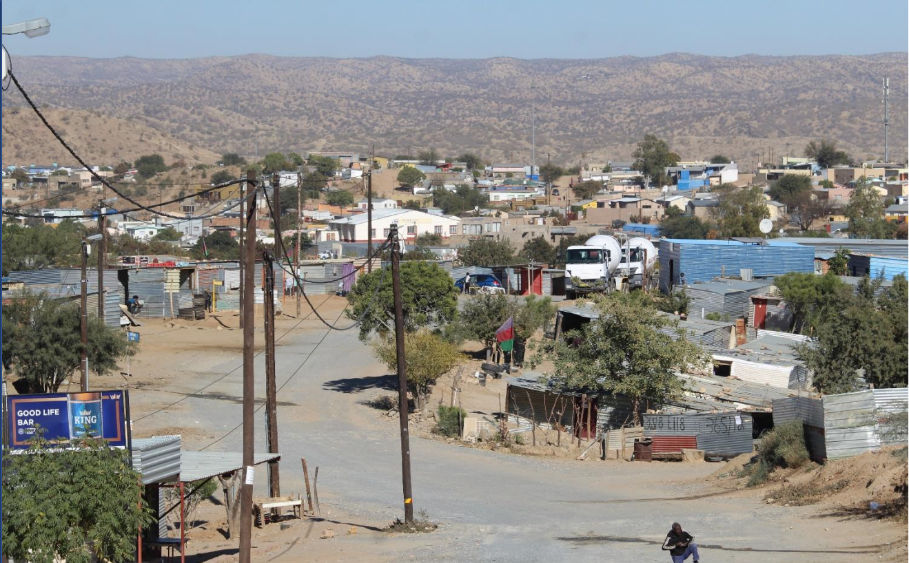
Picture of Havana Proper Informal Settlement in Katutura, Windhoek which is earmarked for more housing development under this pilot project..