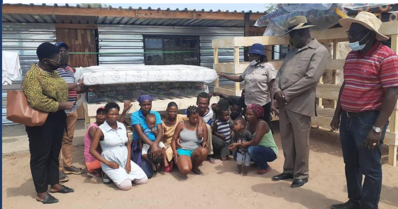
In the background are some of the donated items by NHE.