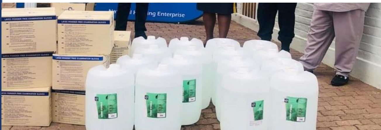
Some of the donated items ranging from Sanitizer, Gloves and Masks.

NHE takes cognizance of the need to protect the first line of Defense against COVID-19 and thus we have joined hands as a commitment to support and strengthen our country's efforts in fighting this pandemic and its impact while ensuring the safety of our men and women in uniform.