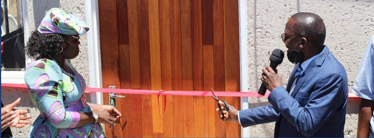
Minister of Urban and Rural Development, Hon. Erastus Utoni (right) handing over a house to a beneficiary during the house handover ceremony in 8ste Laan, Otjomuise, Windhoek.

The National Housing Enterprise (NHE) and its key partners handed over 50 affordable houses to owners at Otjomuise in Khomasdal Constituency, on Thursday 19 November 2020 under the Informal Settlement Upgrading Pilot Project. This pilot project is a joint initiative between the Ministry of Urban and Rural Development (MURD), City of Windhoek, the National Housing Enterprise (NHE) and Khomas Regional Council.